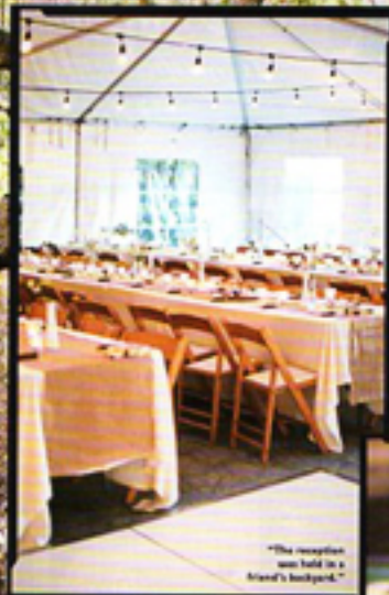
"The reception was held in a friend's backyard."