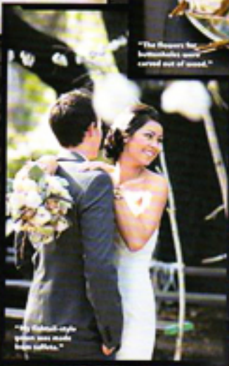
"My friend—my best friend—made my toasts."