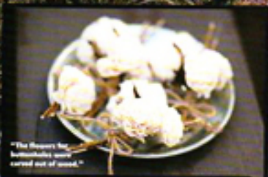
"The flowers for honeymoon were carved out of wood."