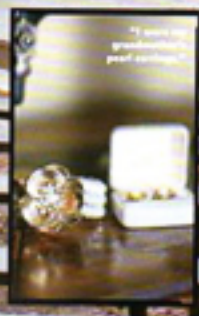
"I used my own wood for the wedding."