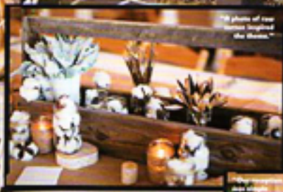
"All photos of our wedding featured the flowers."