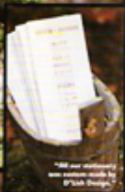
"All our wedding was custom made by D'Ann Design."